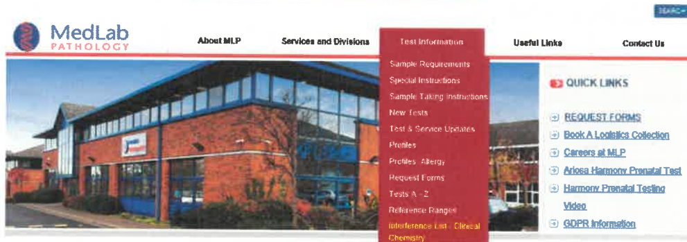
Figure 1. http://sonichealthcare.ie/home.aspx and Test Information Tab

The Interference List is updated each time MedLab Pathology receives notifications from our vendors on a new interference (s) with assays performed in MedLab Pathology.